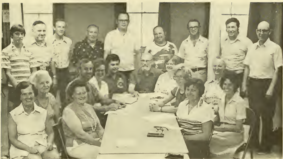
250TH ANNIVERSARY COMMITTEE