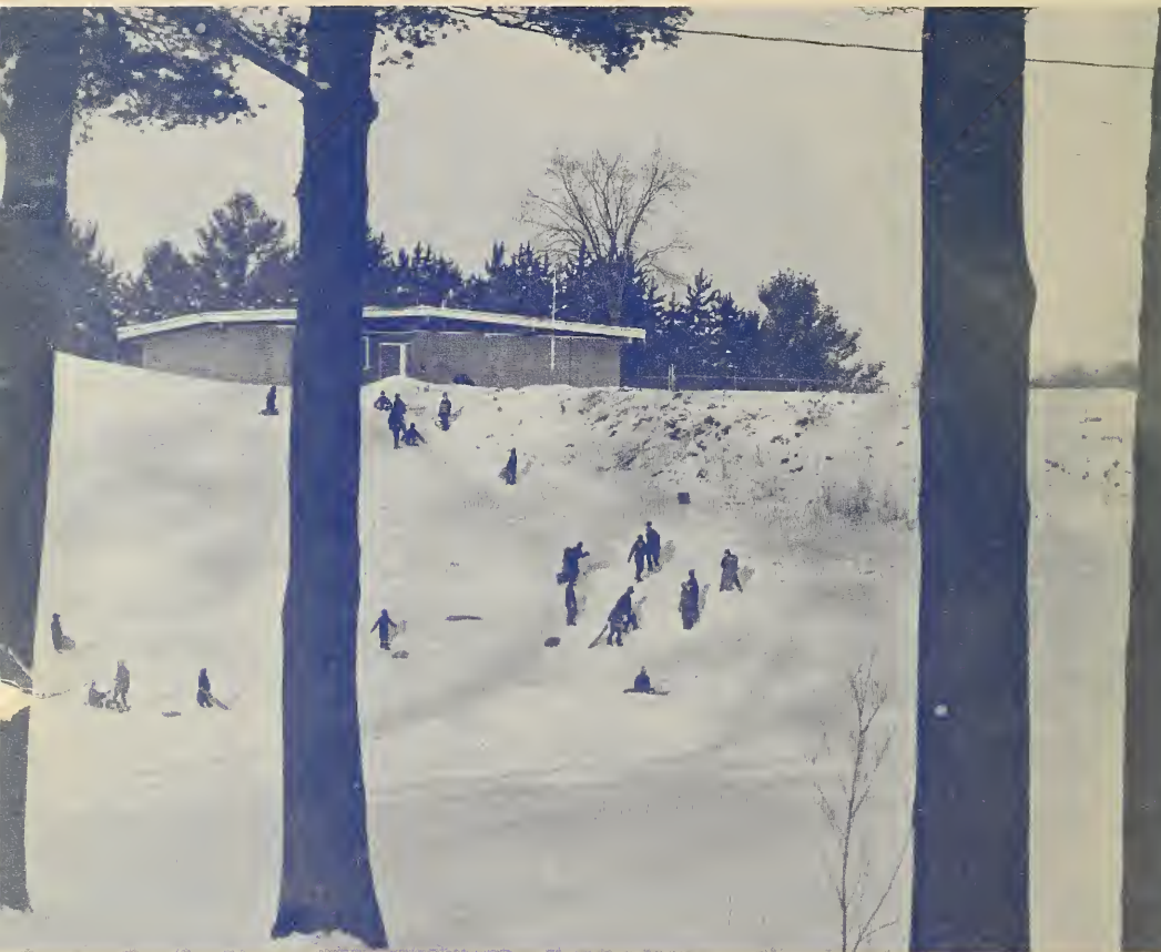
The Remich Park slope is in constant use by Littleton youngsters for skiing, sliding and tobogganing. In the background may be seen the locker room facilities at the Littleton swimming pool.