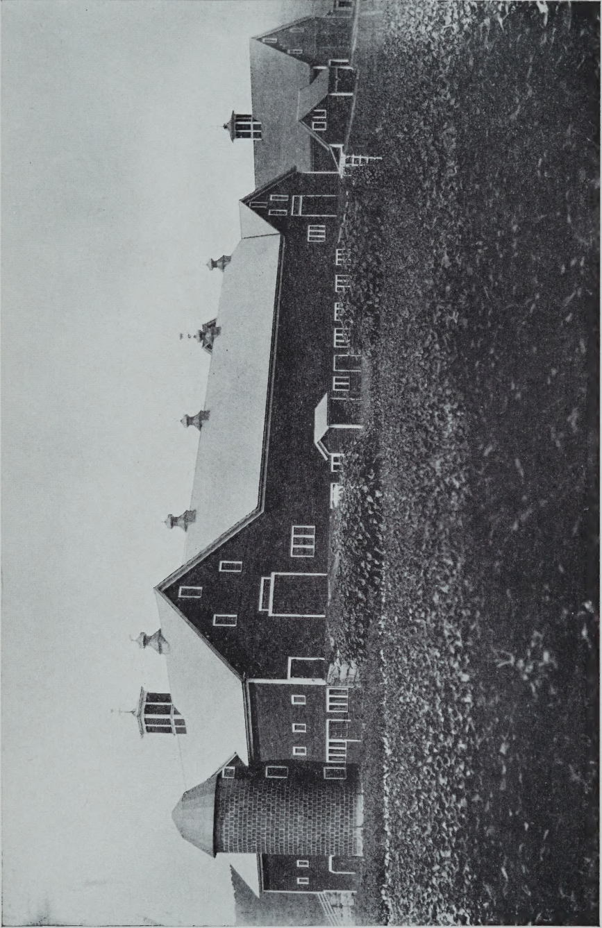
GRAFTON COUNTY FARM BARN