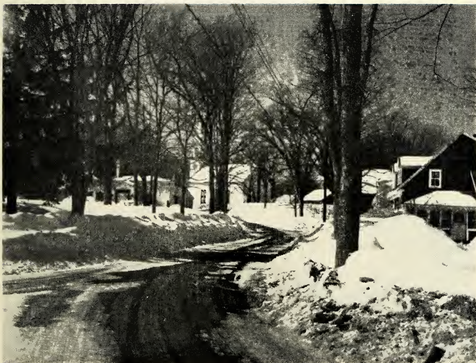
Church Street, Center Sandwich, New Hampshire