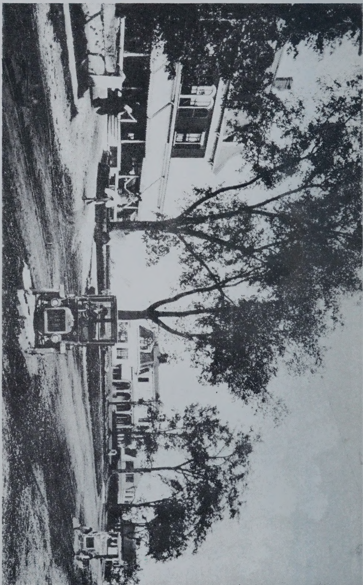
Reproduction of a post card showing Atlantic Avenue opposite Bachelder's Hotel and two automobiles of the approximate period of 1910 - 1915.