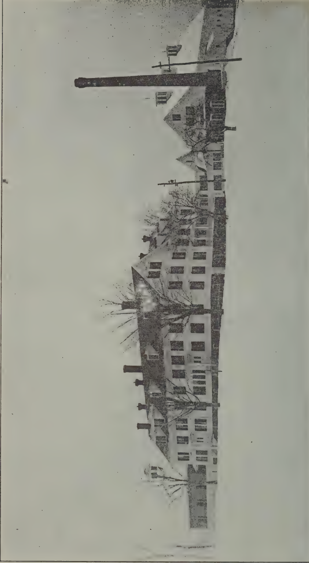
The brick building comprising the house of correction and men's hospital, also the women's apartments are not shown in this picture