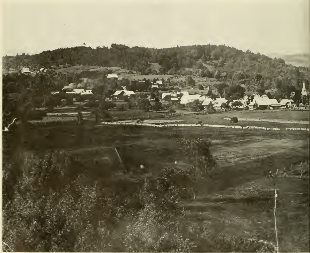
Alexandria Village approximately 1900