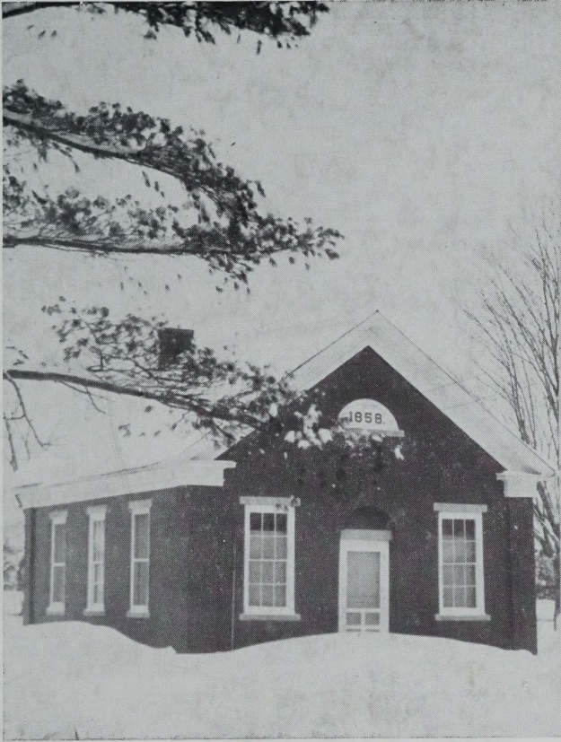
THE LITTLE RED SCHOOL HOUSE IN WAKEFIELD