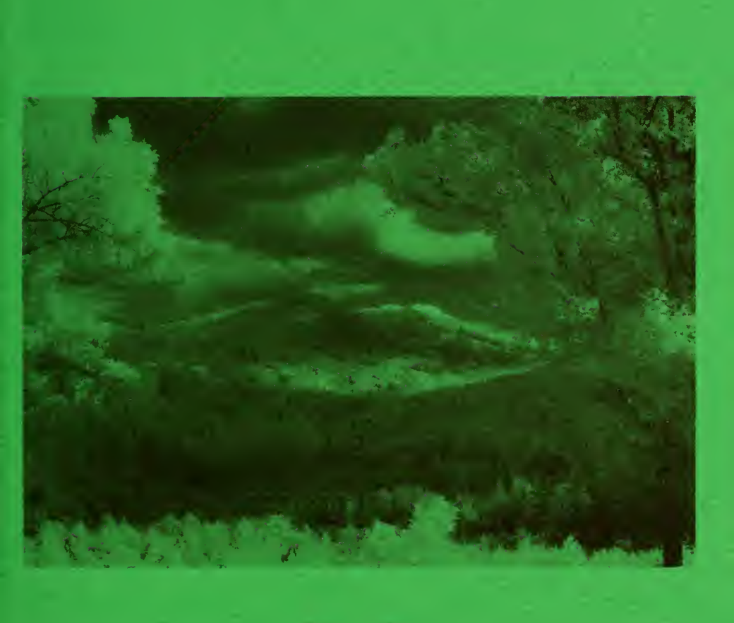
Winter in Dalton