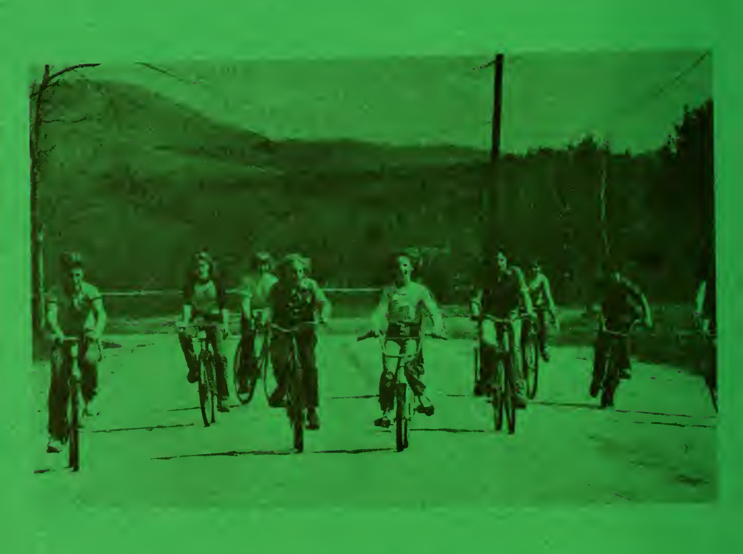
Summer Bikers in Dalton