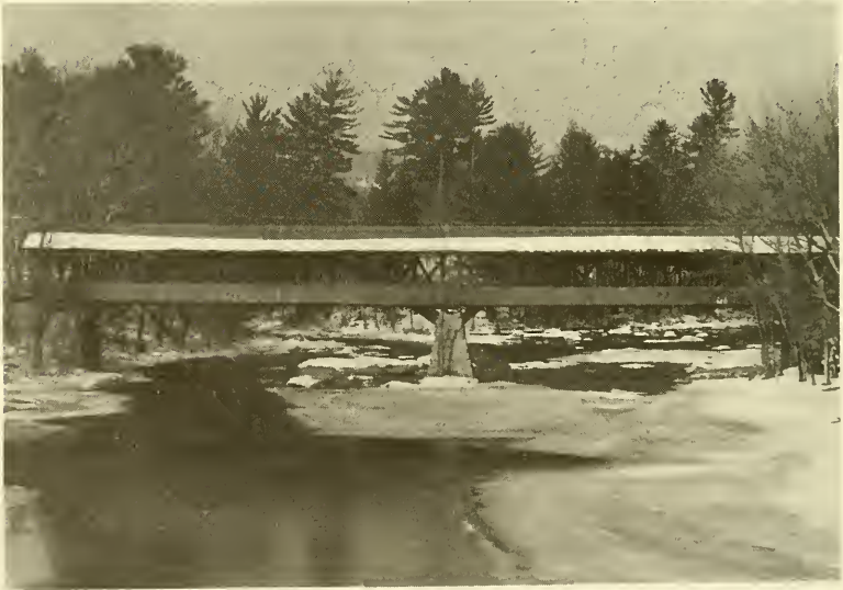
Saco River Bridge