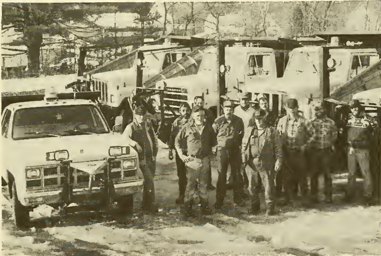
Town of Conway Highway Crew