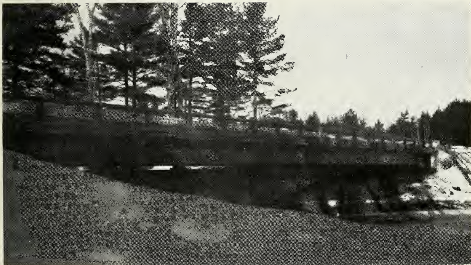
New Concrete and Steel Bridge State Highway 113 Built 1959 - Joint Funds State of New Hampshire and Town of Sandwich