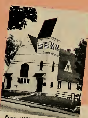
Free Will Baptist Church