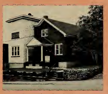
First Church of Christ Scientist