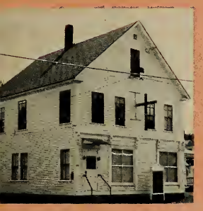
Full Gospel Chapel Assembly of God