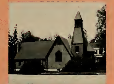
All Saints' Episcopal Church