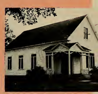
Advent Christian Church