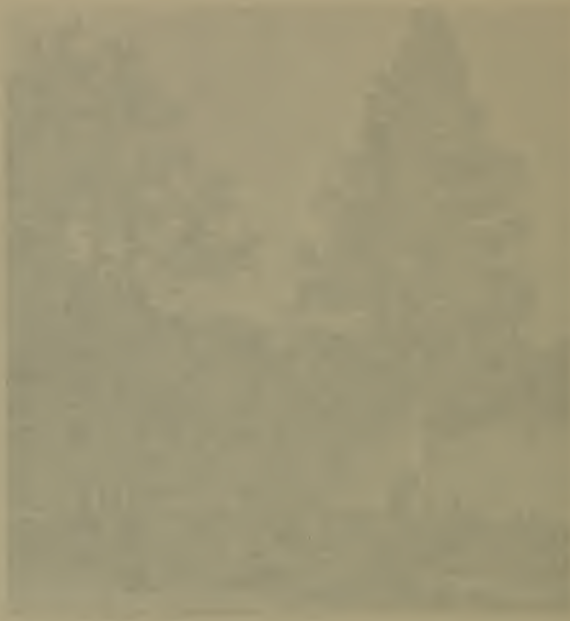
THE HUDSON RIVER BASIN