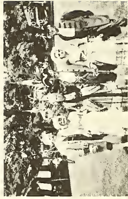
A Few Candid Photos of 225th Anniversary Celebration