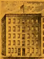
WAREHOUSE 114 HUFFIELD LANE