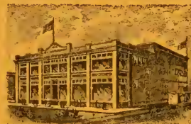
AGRICULTURAL WAREHOUSE, DEPOT STREET