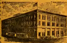
WAREHOUSE 314 WEST AVENUE STREET