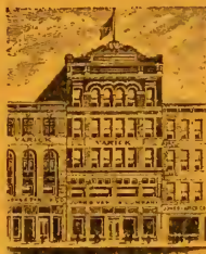
ELM STREET STORES