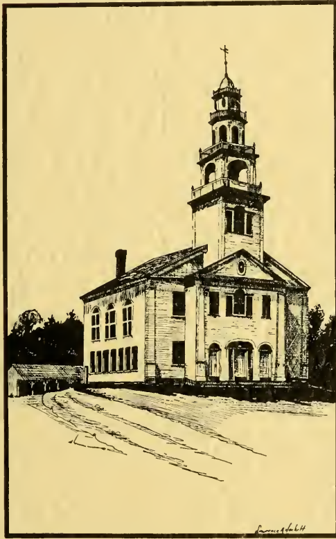
The Acworth Church