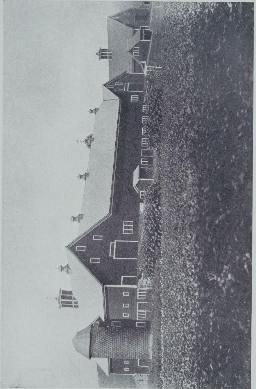
GRAFTON COUNTY FARM BARN