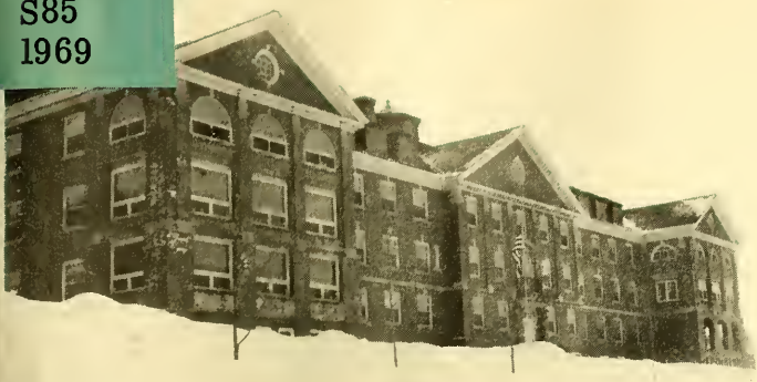
THE COOS COUNTY HOSPITAL