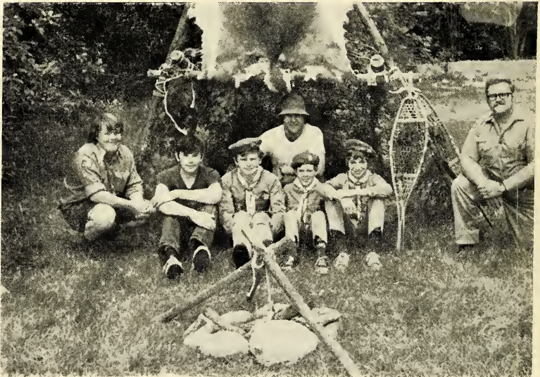
Boy Scouts of Croydon