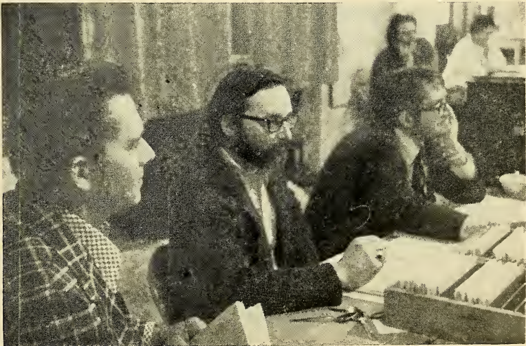
Town Meeting, 1976