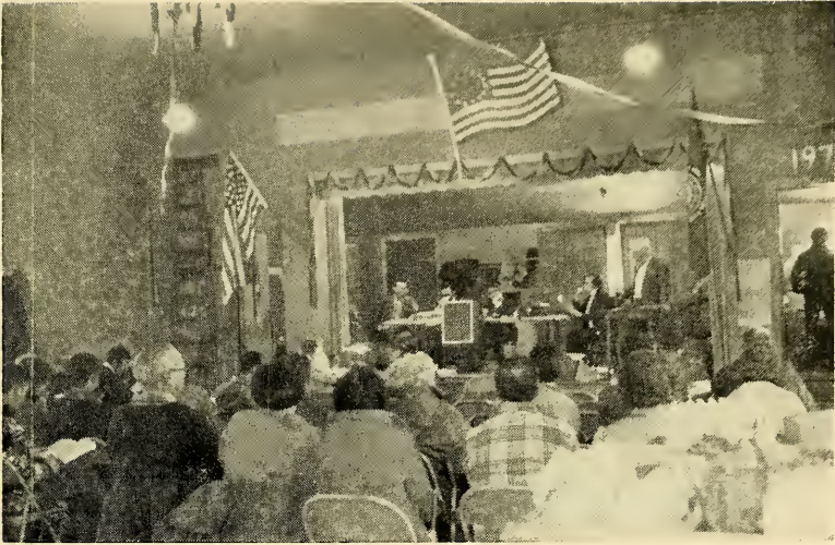
Town Meeting, 1976