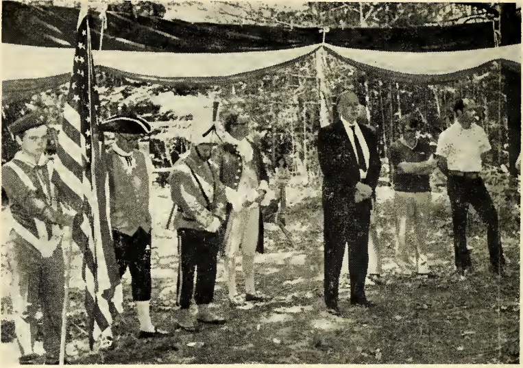
Dedication of the Muzzey Memorial Park, Bicentennial 1976