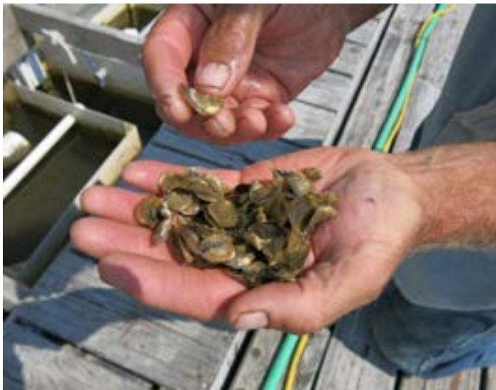
The oyster seeds are 2.5 mm in size when Pemaquid Oyster buys them. Jeff says that seed and labor are two of their biggest costs.

particular is a popular location for oyster farming as well as recreation, which can make the regulatory process even more cumbersome. Jeff says that one of their biggest challenges is the pressure from multi-use demand on the water.