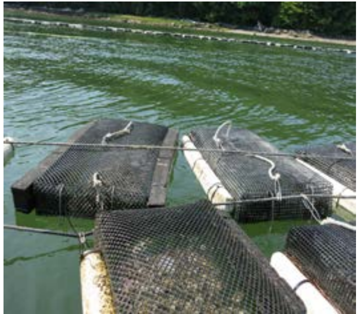
Oyster farmers used to use wooden frames for their equipment, but about 15 years ago had to switch to other materials because of the introduction of shipworms that devoured wood.

Most of the strategies in dealing with diseases and predators focus on prevention. In many cases, once you have the disease, there is not much you can do, says Chris. Even when control measures exist, such as manually air-drying oysters to kill off worms, they are usually not feasible at a large scale. So the key is prevention. This means being sure not to introduce infected oysters into a new population. The partners at Pemaquid buy all seed from within Maine, which prevents new disease being