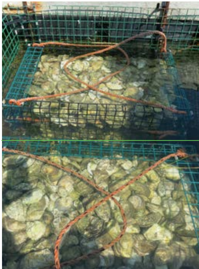
Because oysters are filter feeders and eat algae, they actually help keep the waters clean. Jeff says that heavy storms that wash nutrients into the water can be good for oyster farmers; more nutrients means more algae and more oyster food.

brought into the state. Breeding disease resistant stock has also been very successful. For example, MSX is no longer a problem for oyster farmers in the Damariscotta, because a MSX resistant stock has been developed.