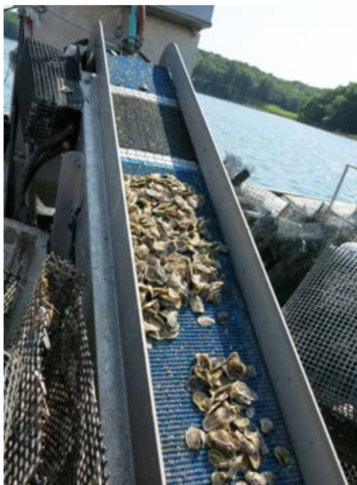
This machine filters the oysters based on their size.

Diversification of crops and markets is a key resilience strategy for many land based farmers, and aquaculture is no different. Chris describes current work in developing a market for seaweed, which he sees as an opportunity for commercial lobstermen and fishermen to diversify. Some seaweed, such as sugar kelp, is a winter crop; in Maine it could be grown between November and May, and then harvested just as lobstermen are putting out their traps. 6 A seaweed industry would have many benefits other than the additional, off-season income it would provide for fishermen; seaweed is a carbon sink, 6 so has potential for climate change mitigation.