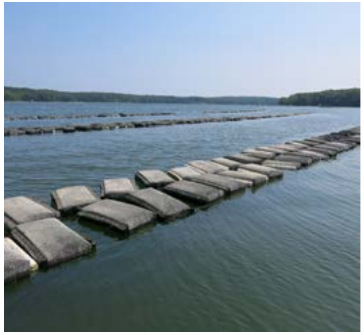
Pemaquid has leased area on the Damariscotta River to grow oysters since it began in 1986.