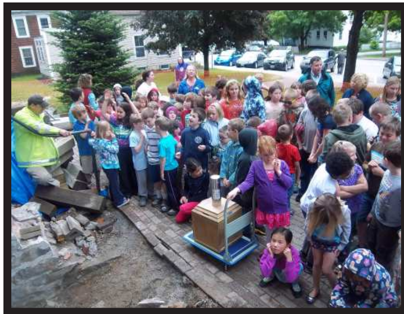
Simonds School students participating in the time capsule ceremony on June 12, 2013. Grades 1 - 5 as well as the Historical Society placed items in the capsule.