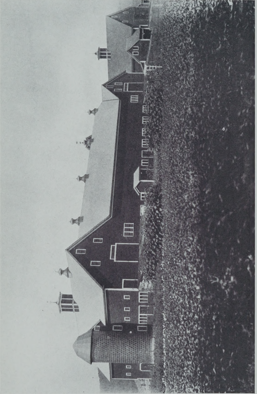
CRAFTON COUNTY FARM BARN