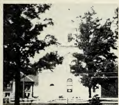
RUMNEY BAPTIST CHURCH