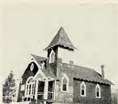
WEST RUMNEY COMMUNITY CHURCH