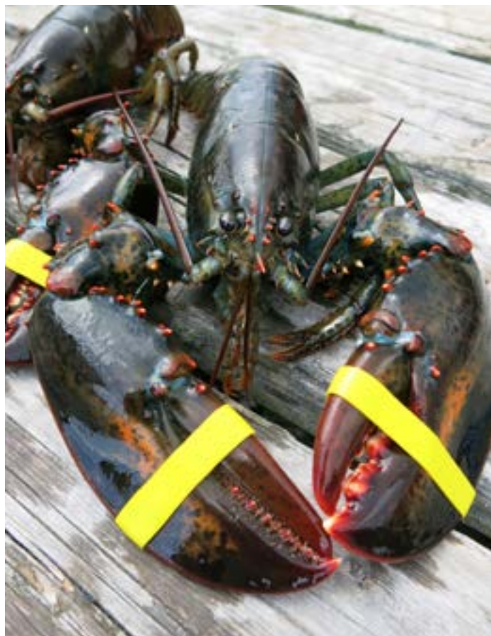
Though he has made his living catching these crustaceans, Steve doesn't like the taste of lobster!

Use of pesticides also represents a problem for lobster populations, particularly as Kittery experiences increased development. Chemicals such as lawn pesticides and mosquito larva insecticides, when used close to the shore, tend to end up in the bay. These pesticides kill the lobster larva. An interesting characteristic of the lobster industry is the time lapse between destructive events (such as a big storm or an influx of chemicals) and when impacts to population are felt. The animals that lobstermen catch are typically at least 7 years old, so the population decrease after a large death of larva may not be noticed for several years.