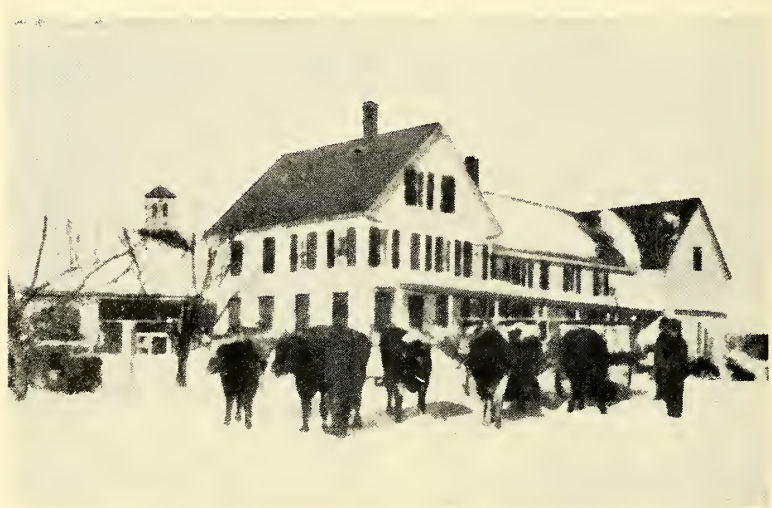
After the Storm at E. L. Cutting's, Ryder Corner, N. H.

It was used as a make-shift hospital during the Small-Pox epidemic and came to be known locally as "The Pest House." It was located on the Turnpike about one-half mile beyond the last house now standing.