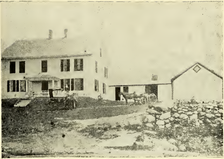
Charles Forehand House

This lovely home once stood on a high point of land overlooking the East Village. The dirt road leading to it and beyond starts at Route #10 by the side of the brick school and has long been known as the Forehand Road.