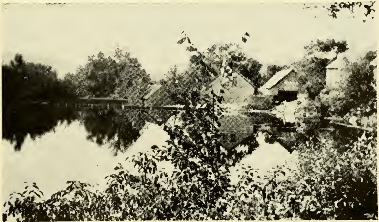
The Dam at East Village

This lovely home once stood on a high point of land overlooking the East Village. The dirt road leading to it and beyond starts at Route #10 by the side of the brick school and has long been known as the Forehand Road.