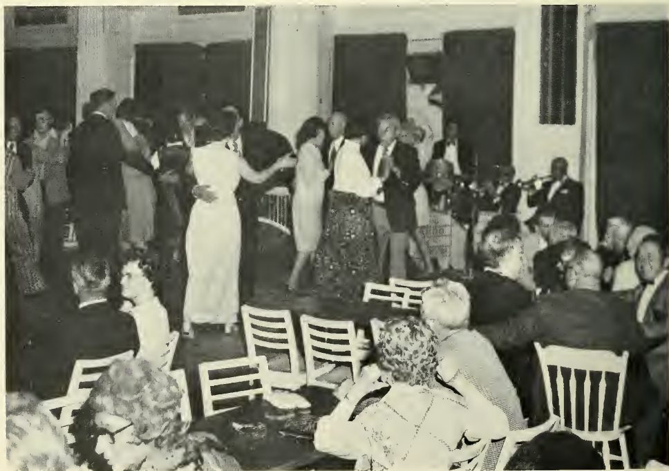
Bi-Centennial Dinner-Dance—Mt. Washington Hotel