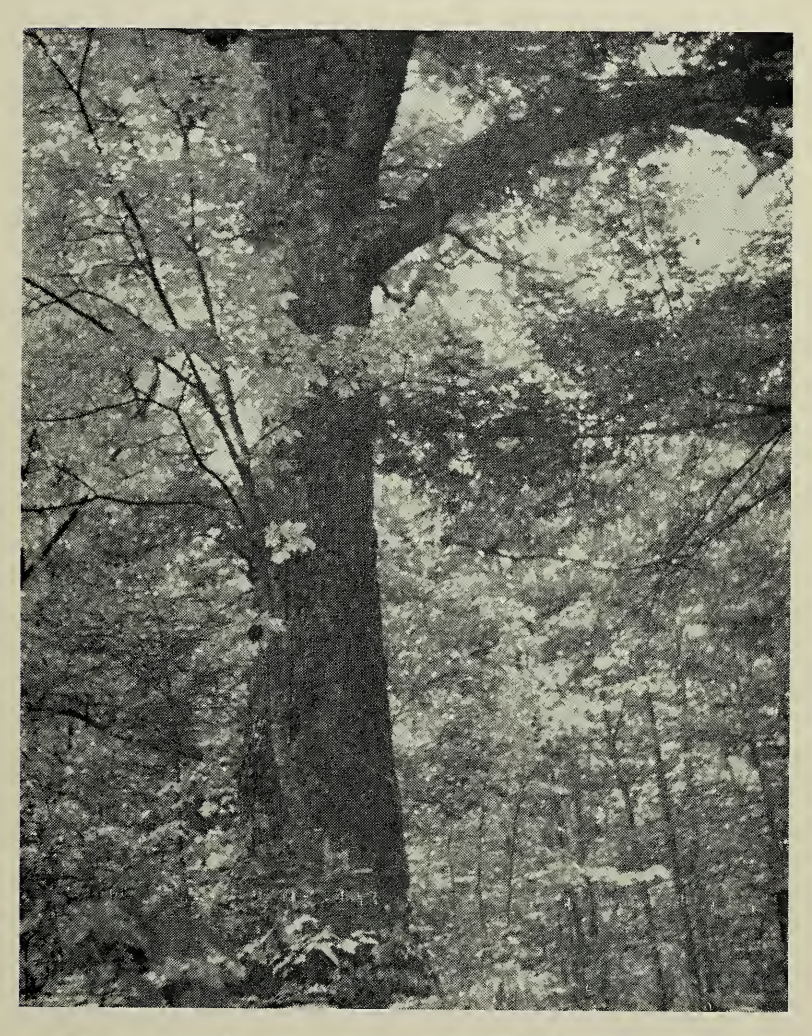
FOR THE YEAR ENDING DECEMBER 31, 1963