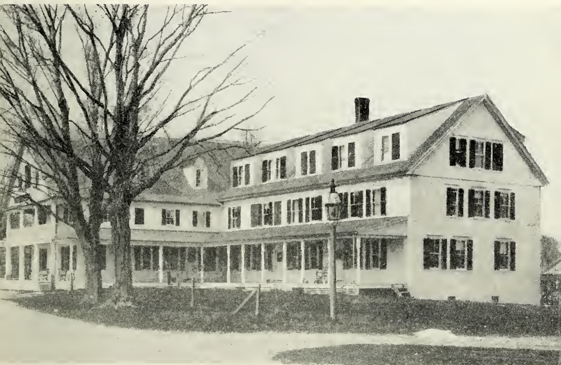
OLD SANDWICH HOUSE, BURNED JANUARY 1, 1916