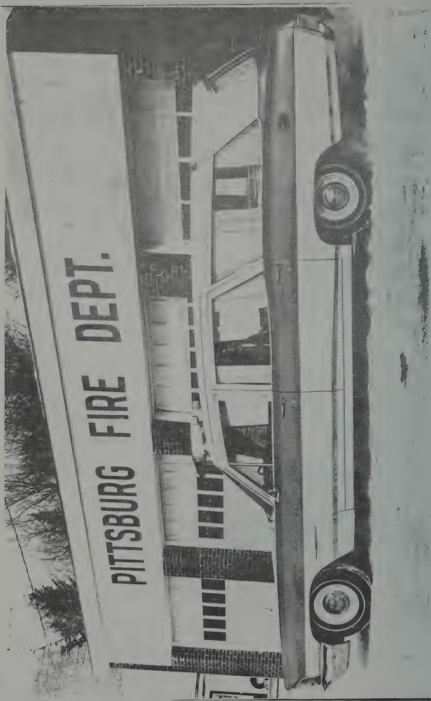
Pittsburg Unit, Ambulance District A-1, manned by Pittsburg Volunteer Ambulance Corps. Vehicle donated by Jenkins Funeral Home, Inc.