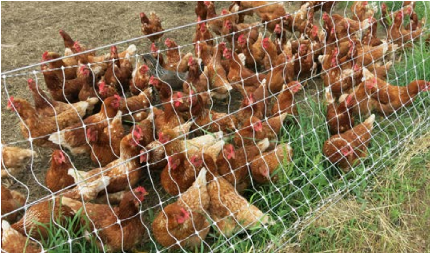
The chickens on the farm are free range. This makes it challenging to control the climate and help them cool off on hot summer days.