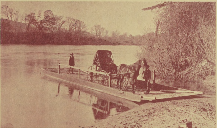
The old Britton Ferry, Westmoreland, N. H.