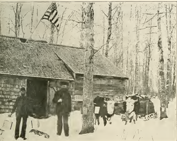
Syrupin' in Sandwich Many Years Ago