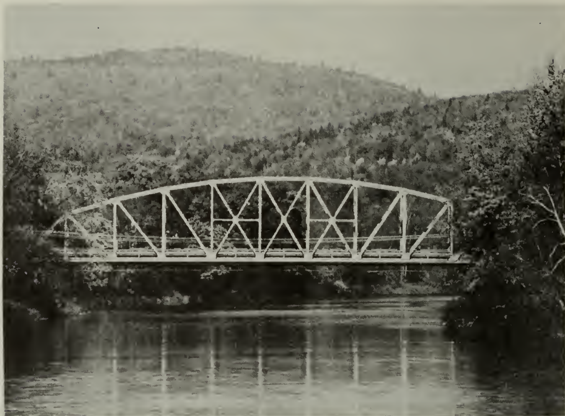
The present steel bridge built in 1934 to replace the Pont Fayette Bridge