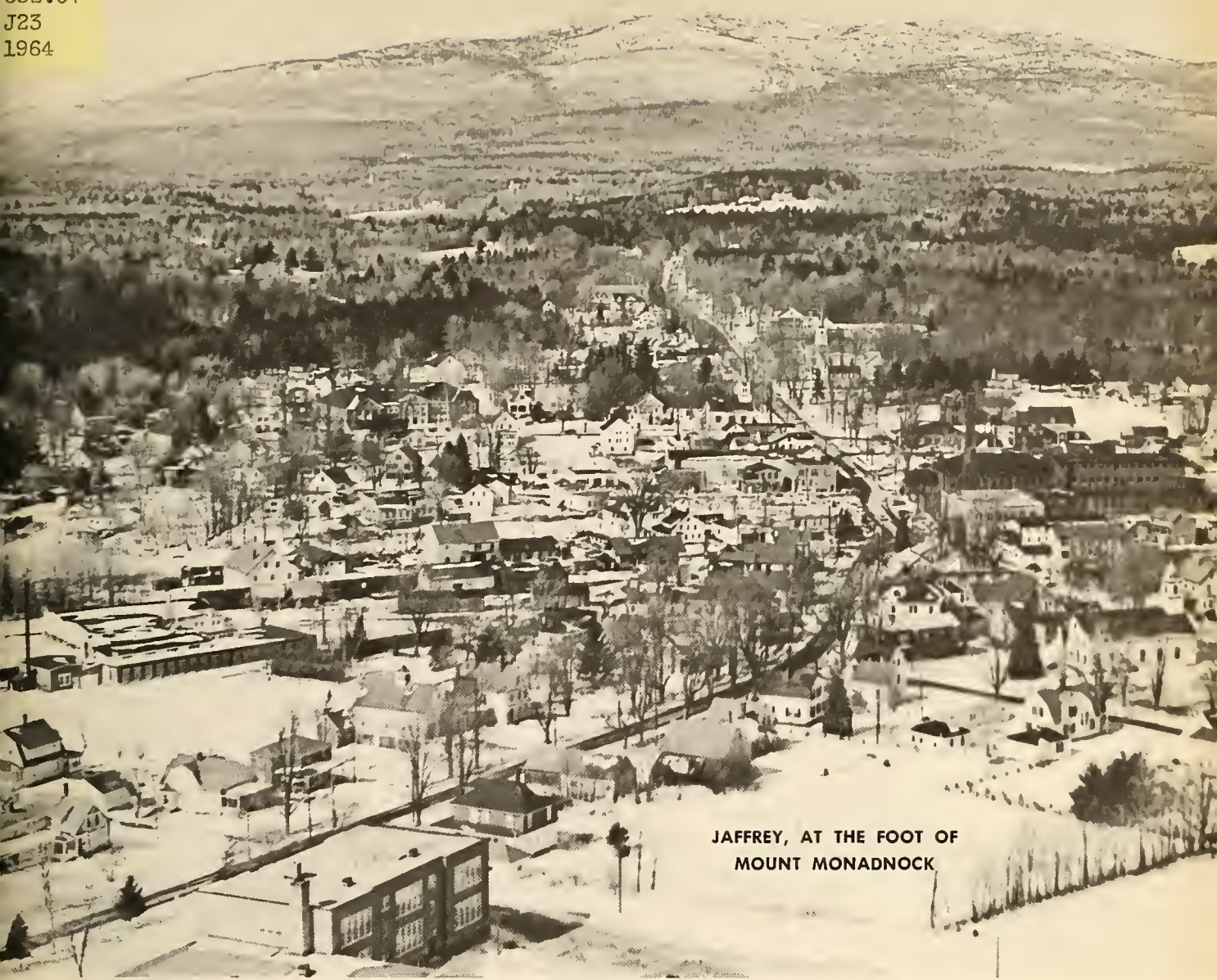
JAFFREY, AT THE FOOT OF MOUNT MONADNOCK