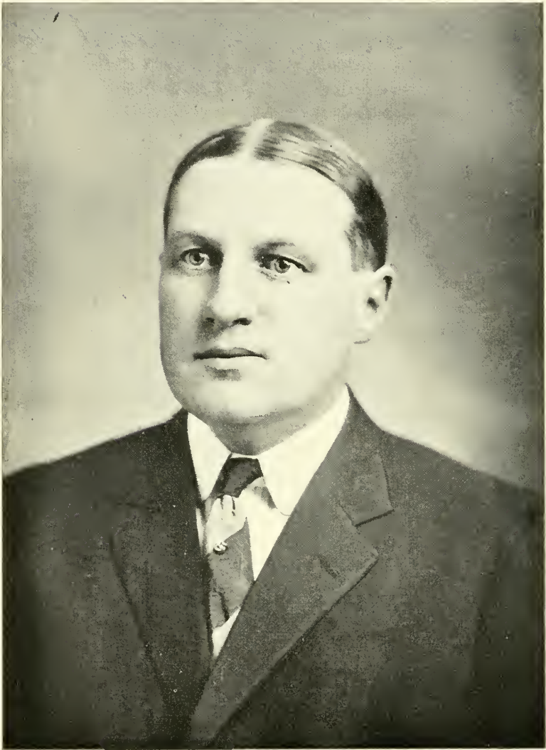
HON. FRED H. BROWN MAYOR OF SOMERSWORTH