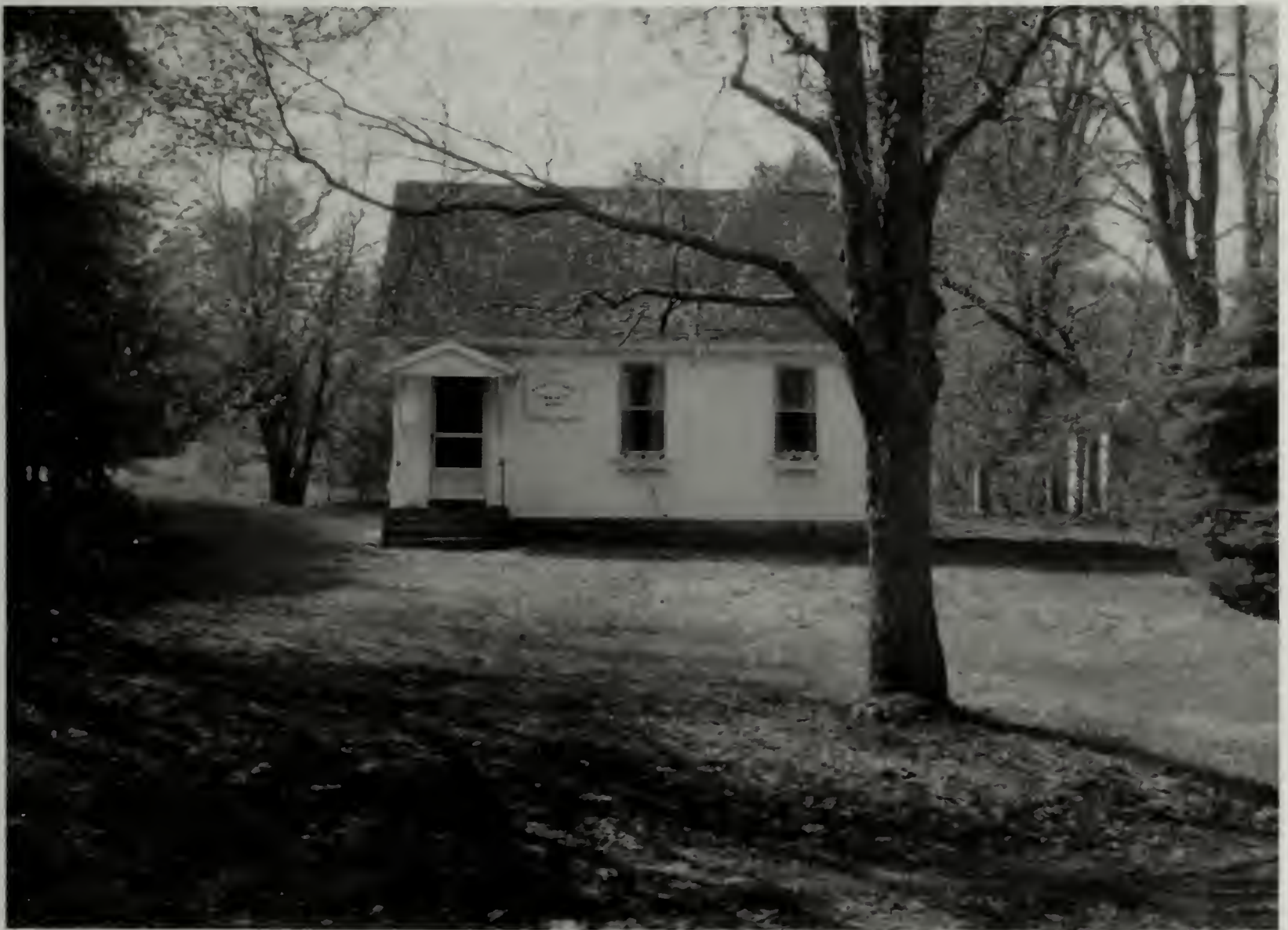
District 10 Schoolhouse