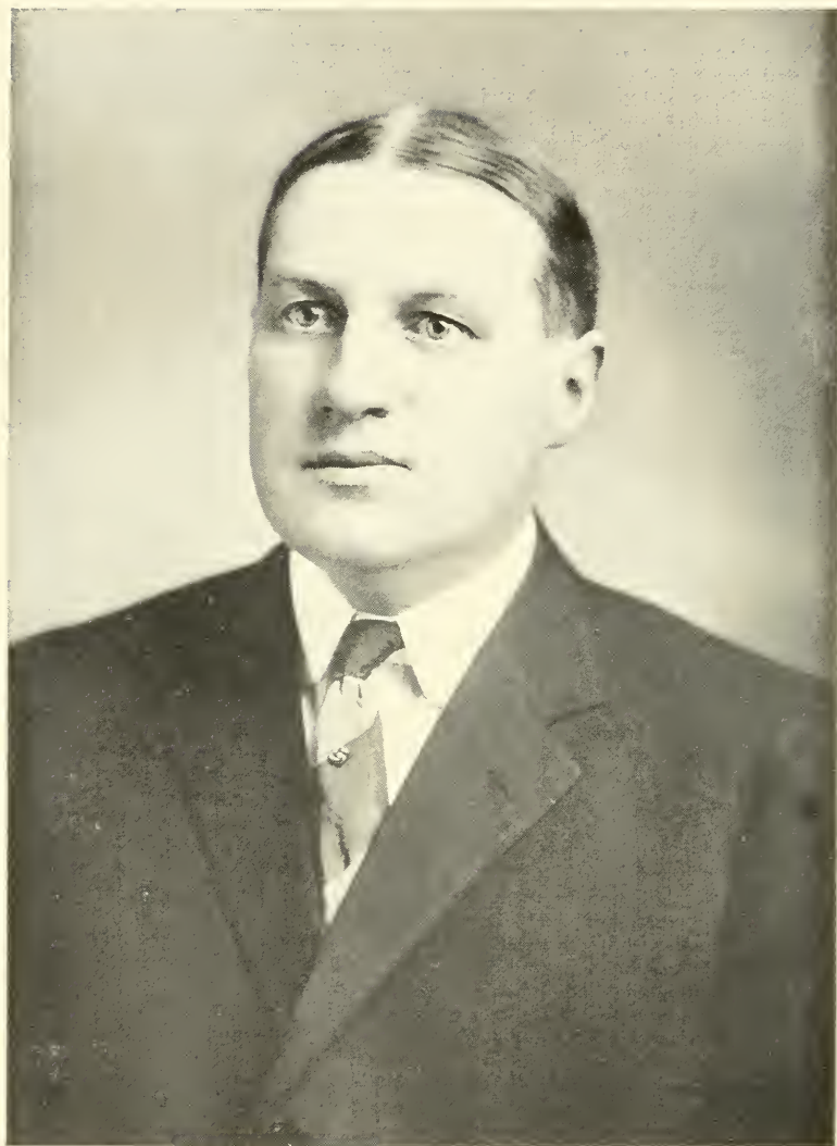
HON. FRED H. BROWN Mayor of Somersworth