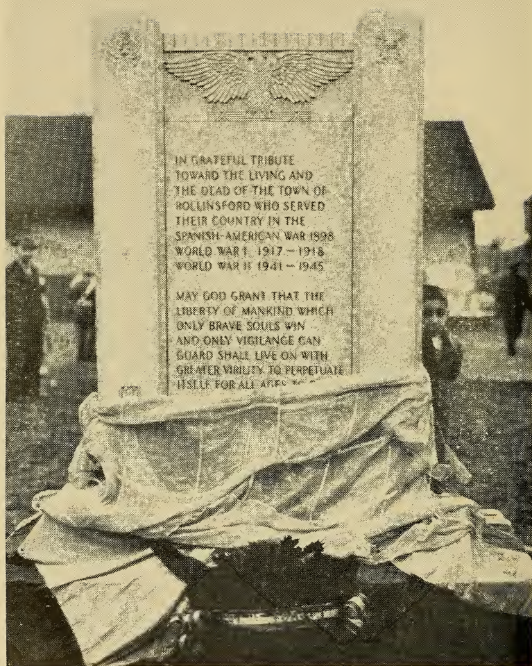
ERECTED BY THE WAR MEMORIAL ASSOCIATION TO THOSE WHO SERVED IN THE SPANISH-AMERICAN WAR, WORLD WARS I AND II.