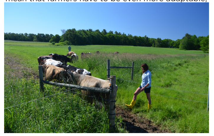
FIGURE 3 : In rotational grazing, livestock are strategically moved to fresh pasture areas to allow vegetation in previously grazed pasture areas to regenerate (1).

Being coastal, Rebecca is aware of rising sea levels, but it's a peril that is out of her hands. Unpredictable weather patterns are a more prevailing concern. "These increasingly variable weather patterns mean that farmers have to be even more adaptable,