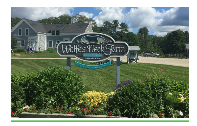
FIGURE 1 : Wolfe's Neck Farm, a 626-acre property on the shores of Casco Bay in Maine, is home to an organic dairy operation.

Erratic weather patterns significantly impacted hay production, a process necessitating at least three to four dry days before cutting and baling. This compelled the farm to haul hay from New York, which increases their costs and their carbon footprint. But, for Rebecca, climate change is all about "being flexible and being ready to adapt in whatever way you can."