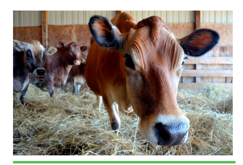
FIGURE 2 : Across the nation, the demand for organic milk is soaring while milk production is in decline, creating a nationwide shortage of organic milk (1).