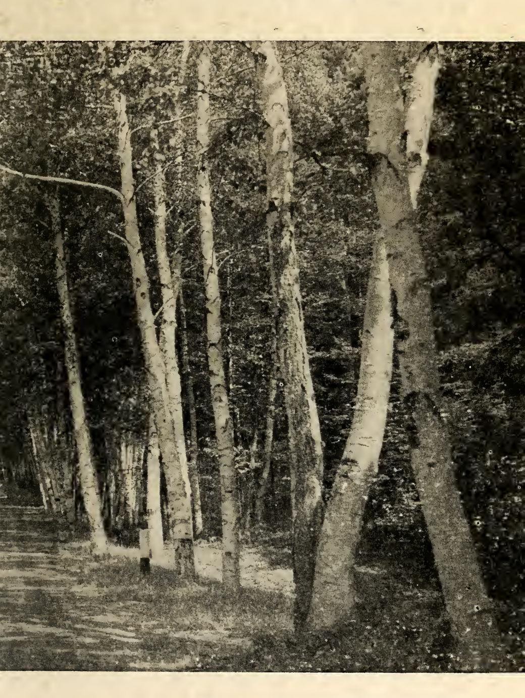
Annual Reports 1962