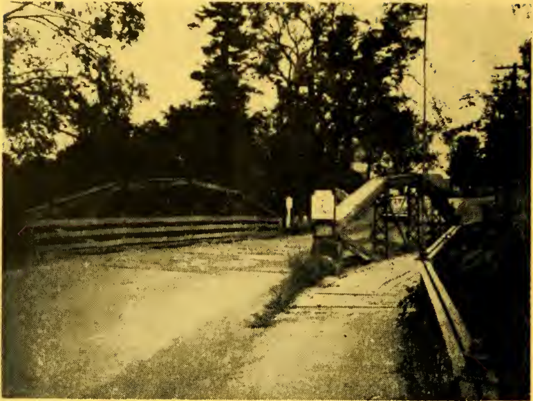
THE OLD BRIDGE