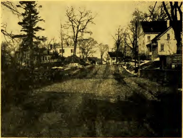
THE NEW BRIDGE