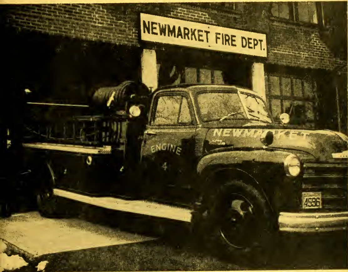
NEW TANK FIRE TRUCK