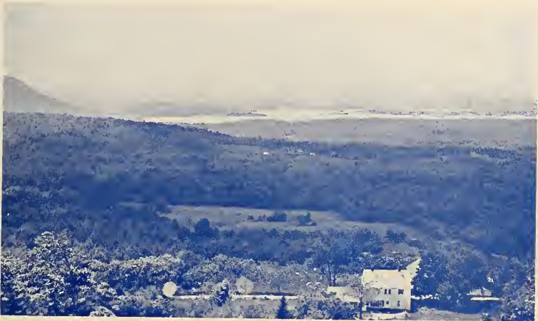
A VIEW FROM DIAMOND LEDGE LOOKING SOUTHERLY SQUAM LAKE IN THE DISTANCE