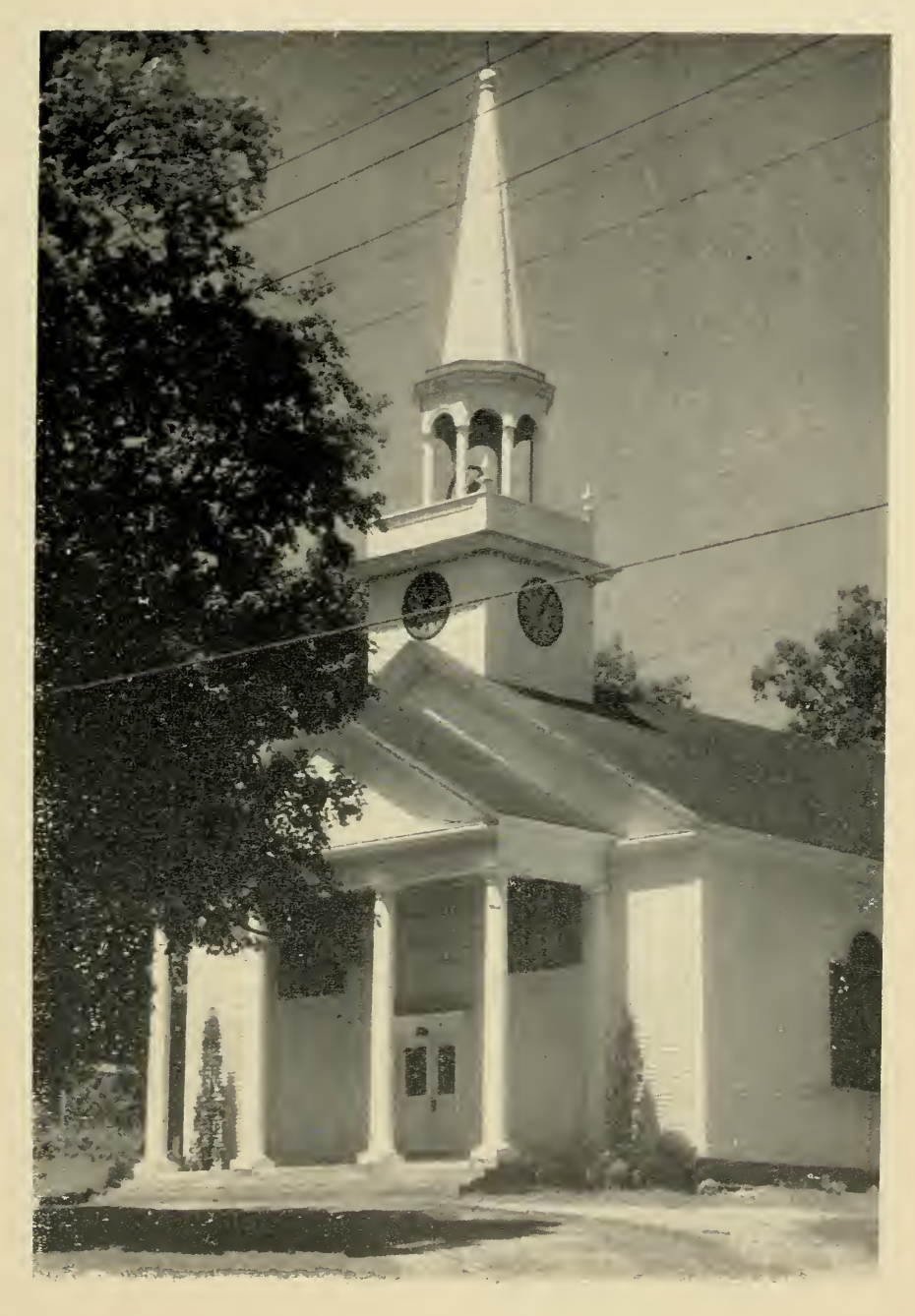
BRADFORD BAPTIST CHURCH