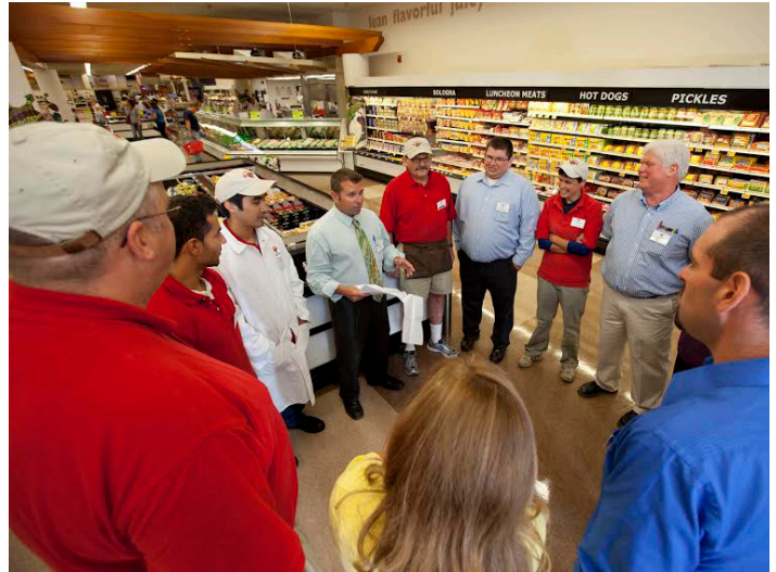
FIGURE 5: Associates, or employees in Hannaford language, were key to the success of the program. Giving associates ownership over the program gave them the momentum, knowledge, and initiative to become champions of the program.