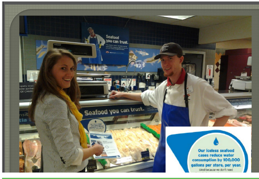
FIGURE 2: Hannaford is a leader in the field, spearheading novel initiatives to minimize resource consumption, such as iceless seafood cases.