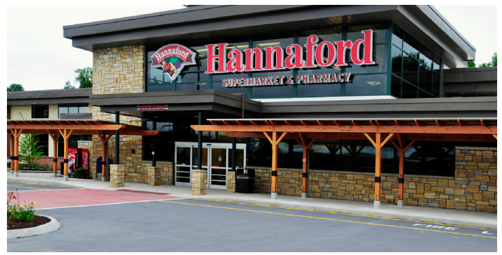
FIGURE 1: Hannaford became the first grocery store chain in the nation to earn the coveted 'Grocery Steward Certification'.

Sustainability is at the crux of Hannaford's business model. The company strongly believes that "it's about being responsible for our future, it's about being responsible for our world" (1). Hannaford is a leader in the field, spearheading novel initiatives to minimize resource consumption. For example, the company installed iceless seafood cases, which reduce water consumption by 100,000 gallons per store annually. This year, Hannaford became the first grocery store chain in the nation to earn the coveted 'Grocery Stewardship Certification' with Manomet. A