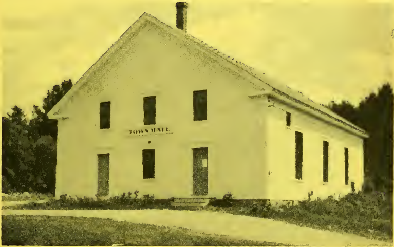
STRAFFORD TOWN HALL 1873 - 1960