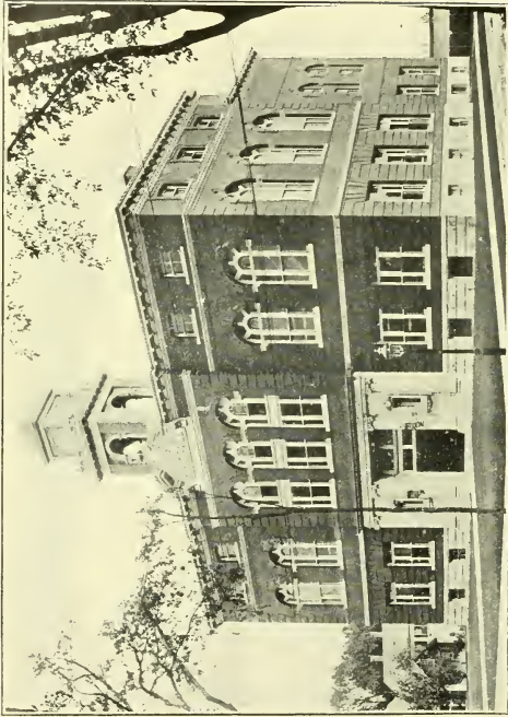
CITY HALL AND OPERA HOUSE