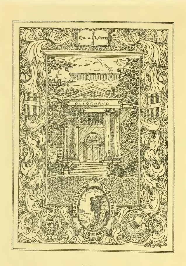
GIFT OF City of Berlin