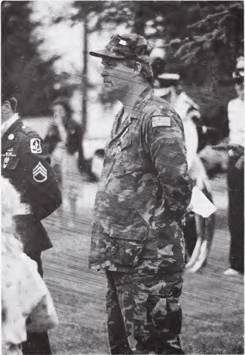
A Purple Heart Recipient