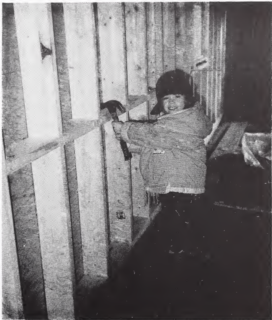
T.E.A.S.I. Building Supporter/Supervisor