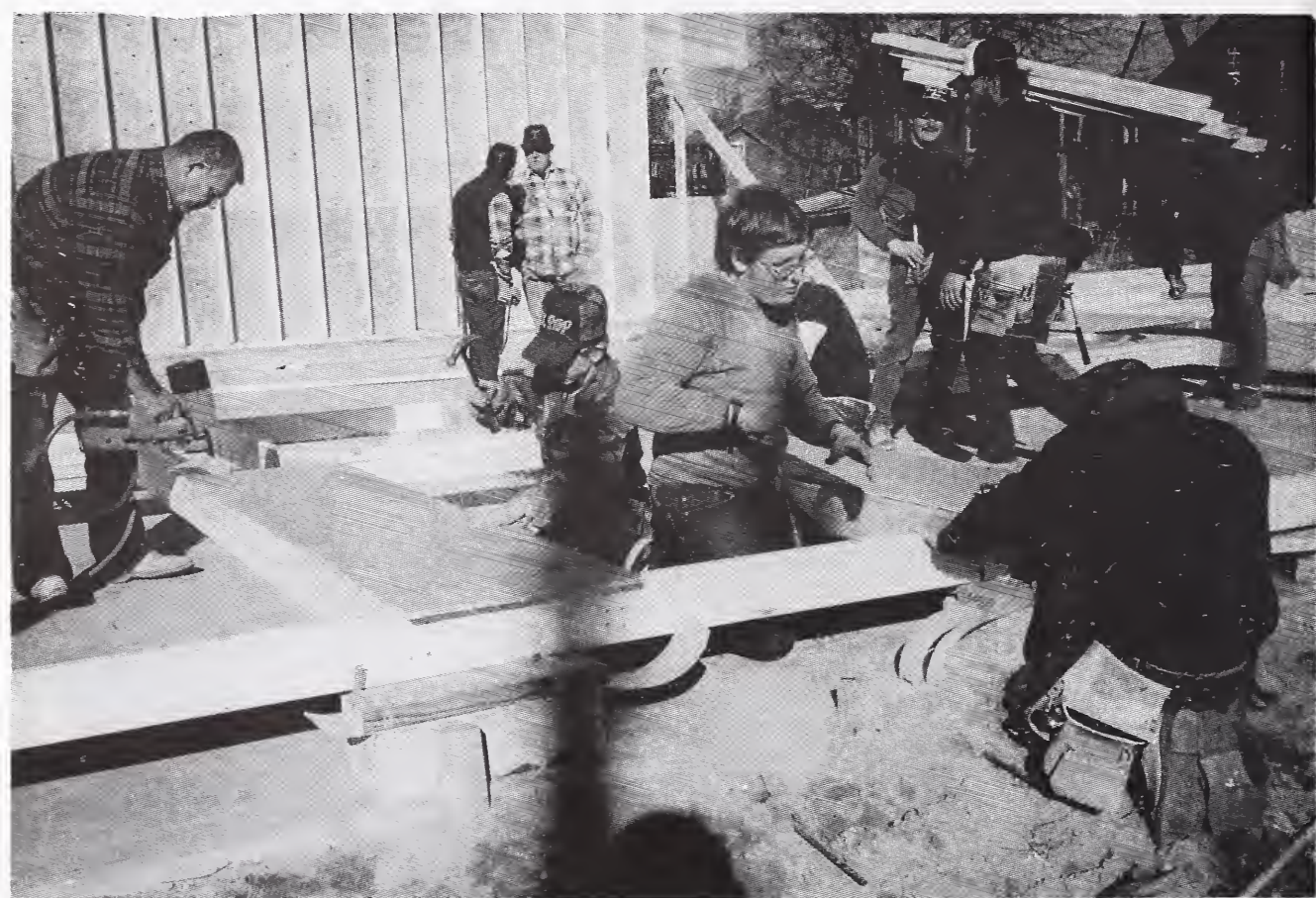
T.E.A.S.I. Building Work Bee