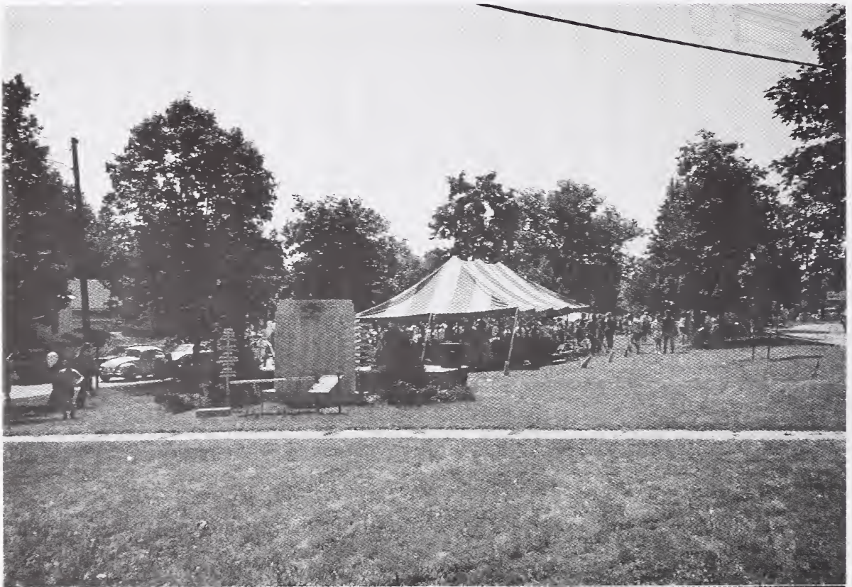
Troy Arts Festival