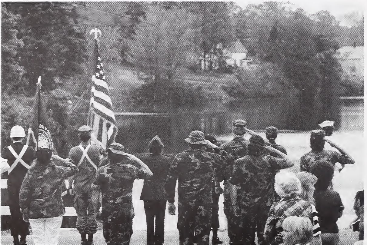
A Moment of Silence at Village Pond