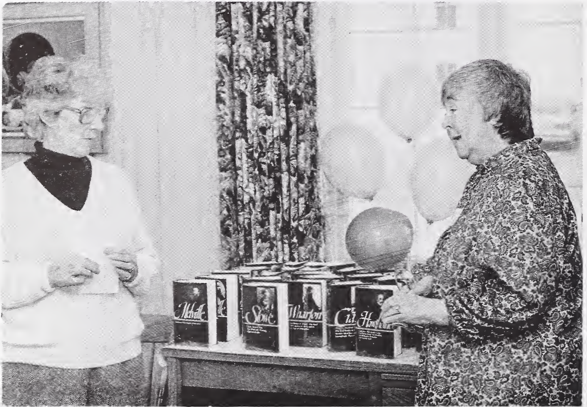
Honor to a Dedicated Librarian