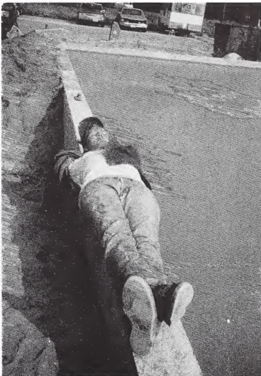
Some T.E.A.S.I. workers grabbed shut eye whenever and wherever possible!