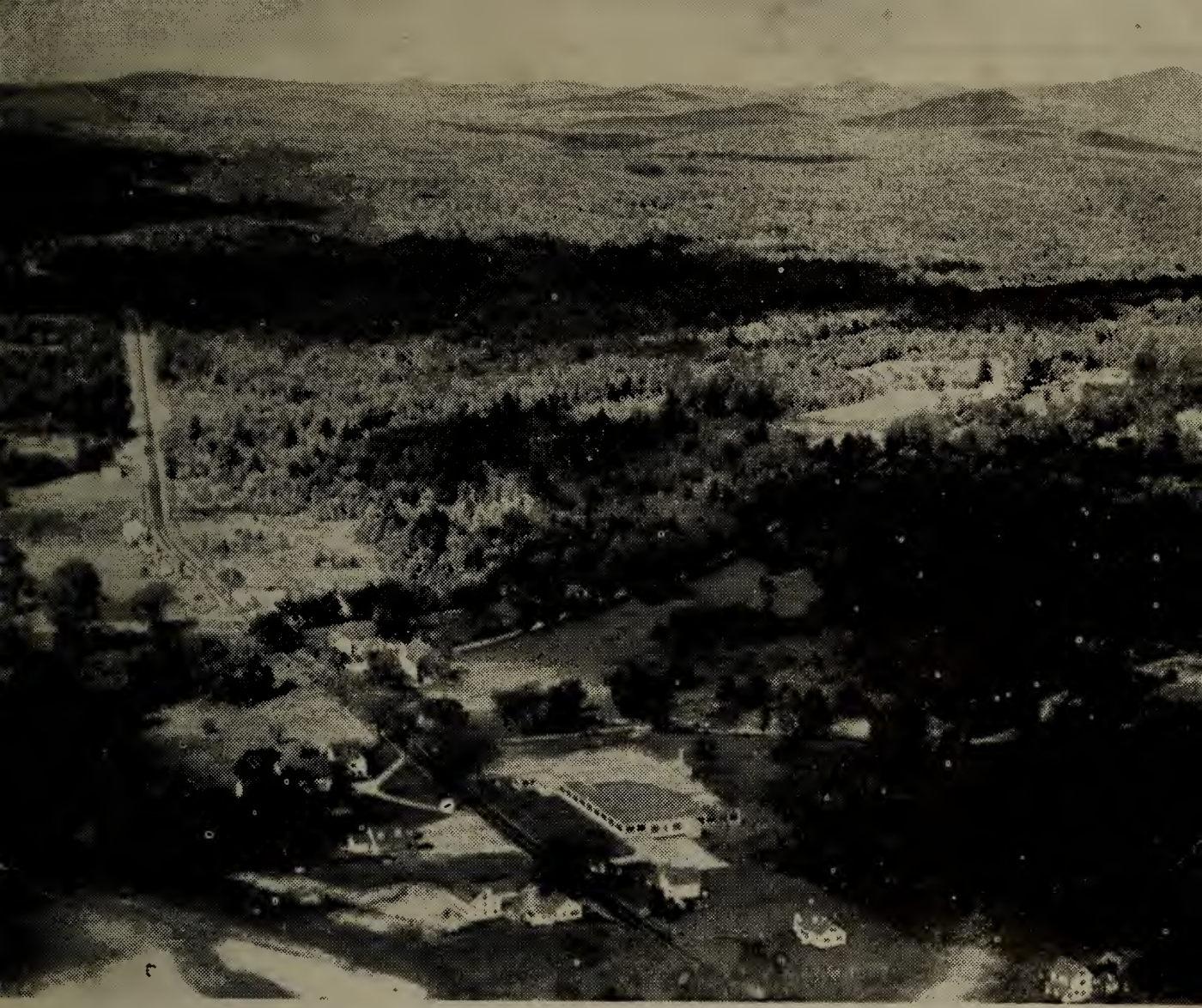
Aerial Photo by Manahan Studio