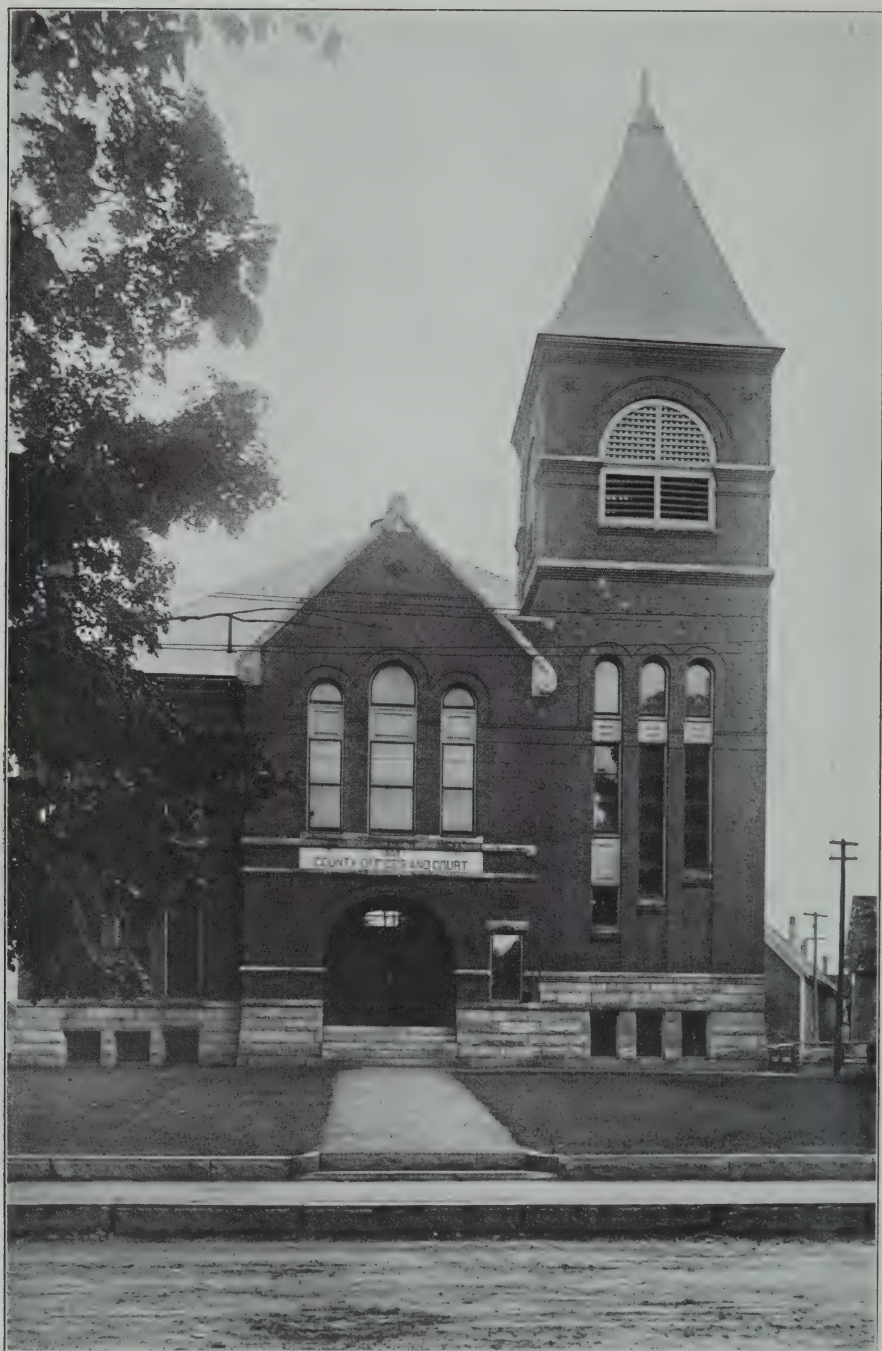
GRAFTON COUNTY COURT HOUSE, WOODSVILLE, N. H.