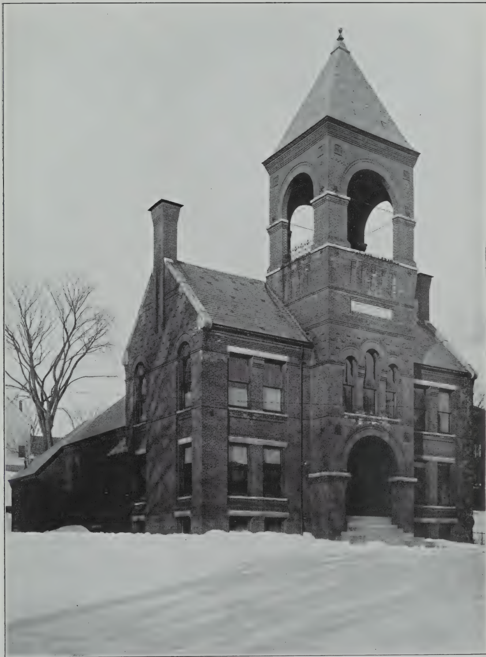
GRAFTON COUNTY COURT HOUSE, PLYMOUTH, N. H.